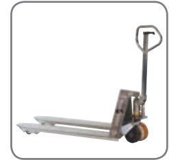
The pallet truck is also available in an explosion proof version.