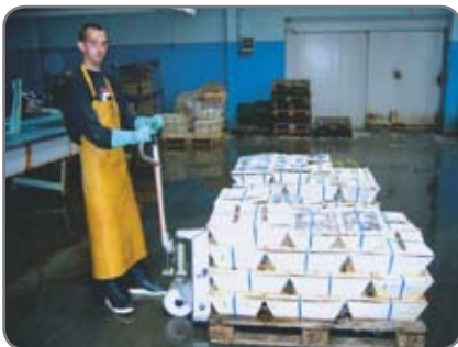
RF-SEMI - for the food industry in areas, where hygiene demands are not so high, but corrosion resistance important.