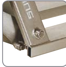
Completely open or completely closed truck elements facilitate efficient cleaning.