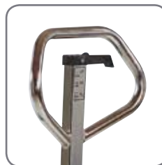
Ergonomic handle ensures the user a relaxed hold.