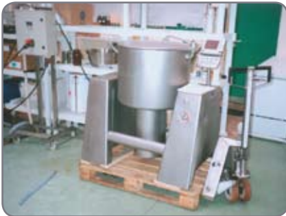
RF-PLUS - for the food industry and the pharmaceutical industry with strict hygiene and sanitation requirements.