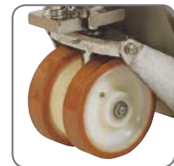
Wheels with rubber-sealed bearings.

Please ask for specification details or visit our website www.logitrans.com We also offer tailor-made solutions.