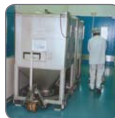
RF-PLUS pallet truck being used in the pharmaceutical industry.