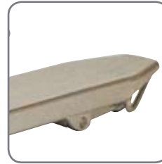
Closed forks mean easy cleaning and few hiding places for bacteria.